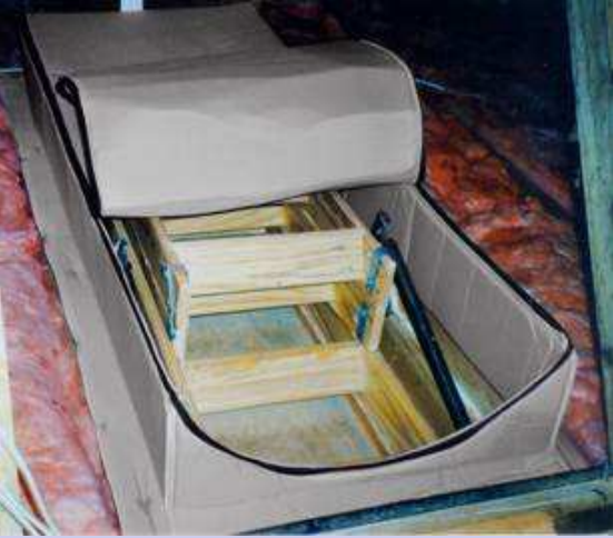
No more wasted energy through and around the attic door or stairs with Attic Tent.

The Attic Tent is specifically engineered and patented insulator designed to create an air transfer barrier between your attic and your living space below. It is a practical and economical solution to a problem that has existed in homes for many years.